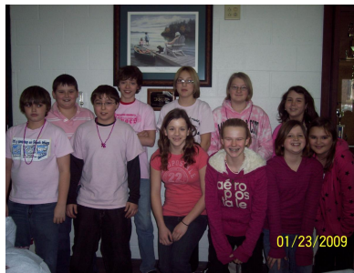
AHS/AJH FOOD DRIVE ASSEMBLY

They are beside themselves! A missile too. By Collin Wicks